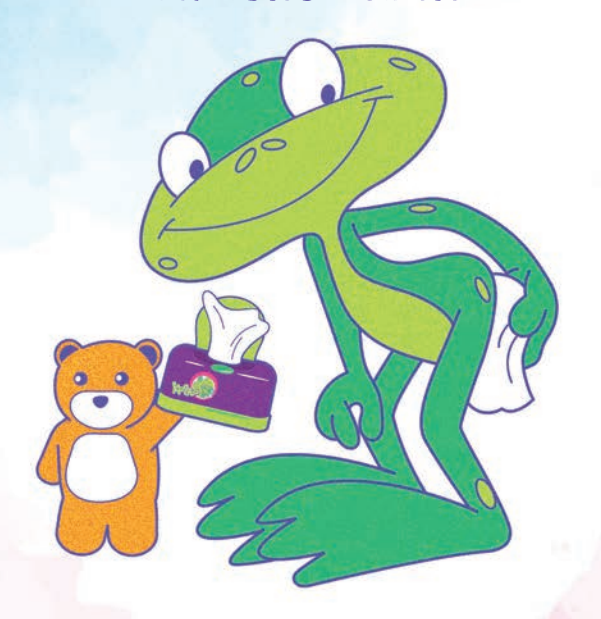
Remember to wipe your bottom