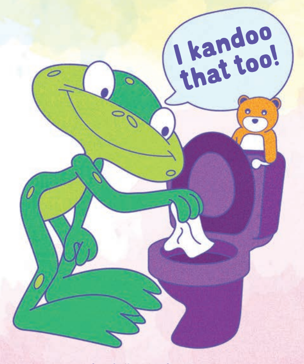
And flush it away